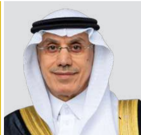
H.E. Dr. Muhammad Al Jasser Chairman, IsDB Group