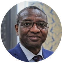
H.E. Dr. Mansur Muhtar

Mansur Muhtar joined IsDB in December 2015, and currently serves as Vice President Country Programs Complex (Formerly Operations). He has served as Ag. Group Chief Economist, and Ag. Chief Product and Partnerships Officer. He served as Executive Director on the Board of the World Bank Group (2011-2014) as well as Co-Chair of the UN Inter-Governmental Committee of Experts on Sustainable Development Finance (2013-2014). He has served as Minister of Finance, Budget and Economic Development for the Federal Republic of Nigeria and as Chairman of the Country's National Economic Management team (2008-2010), as Executive Director, African Development Bank (2007-2008) and as Director-General of Nigeria's Debt Management Office (2003-2007).