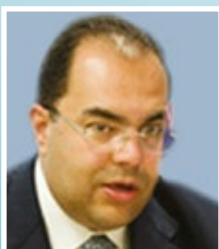
Mr. Mahmoud Mohieldin Senior Vice President for the 2030 Development The World Bank