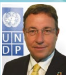
Mr. Achim Steiner The Administrator, UNDP