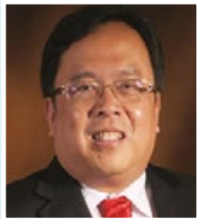
Mr. Bambang Brodjonegor Minister of National Development Planning, Indonesia