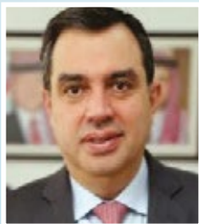
Mr. Imad N. Fakhoury Minister of Planning & International Cooperation, Jordan