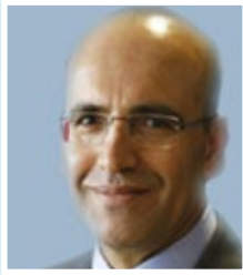
Mr. Mehmet Şimşek Deputy Prime Minister for Economic Affairs, IDBG Governor, Turkey

03 April 2018 at 11:00 - 13:00 Ramada Hotel (Didon 1) Tunis, Tunisia